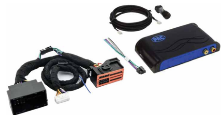
APSUB-CH41 Subwoofer Amplifier Integration Interface