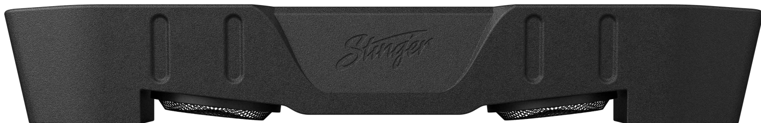
Front of Enclosure

Intensify Your Jeep Gladiator's Audio Experience with this Custom Dual 8" Vented Subwoofer Enclosure!