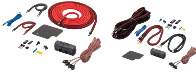
STXKJW4 & STXKJW8 Underseat Amplifier Wiring Kits