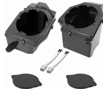
STXJLPOD Front Speaker Adapters