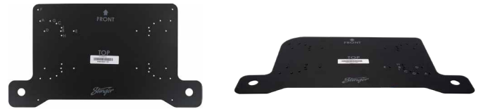
JLUAMPBRKTD & JLUAMPBRKTP Underseat Amplifier Mounting Brackets