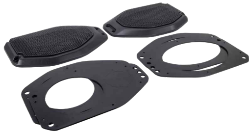
STXJLSBA Soundbar Speaker Adapters