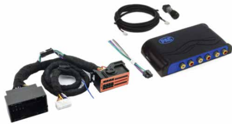
AP4-CH41 Amplifier Integration Interface