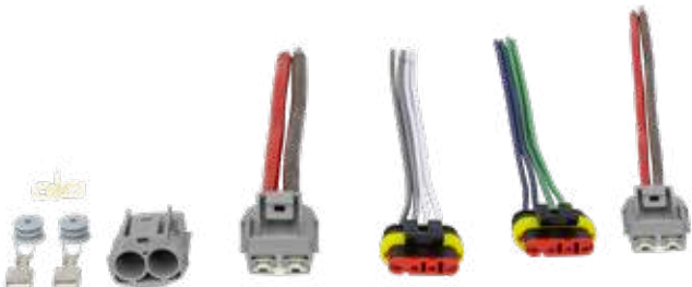
Quick connect wiring pigtails and male power connector included with all models. *Included connectors will vary based on model.