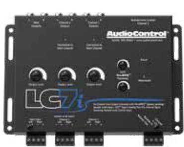
LC7i 6 Channel Line Out Converter with Accubass®