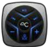
Blue w/White Glyph AUX input mode