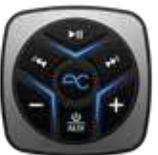
Blue w/White Zone 3 volume adjust

The backlighting on the ACX-BT3 offers a simple and clear method of communicating the unit's status. Simply tap the center button with the AC logo on it to switch between the 3 zone volume controls, or use the power/aux button to control on/off and AUX input modes.