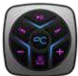
Blue w/Pink Zone 1 volume adjust