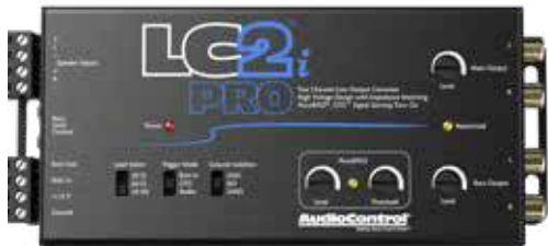
LC2i PRO 2 Channel Line Out Converter with Accubass® and Subwoofer Control