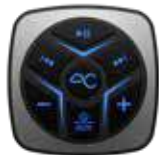
All Blue Powered on/in BT audio mode