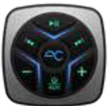
Blue w/Green Zone 2 volume adjust