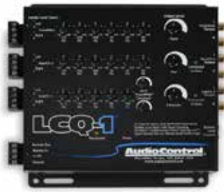
LCQ-1 6 Channel Line Out Converter with Eq and Accubass®