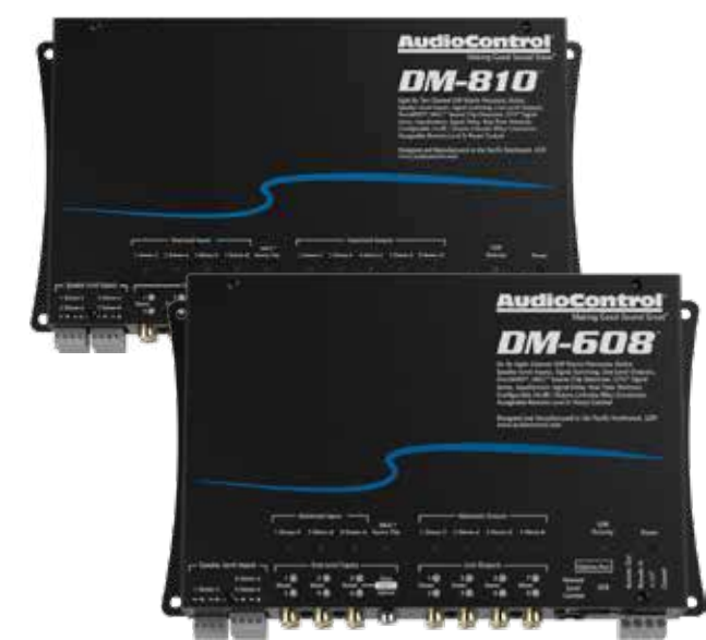
DM-810 Premium 8 input 10 output DSP matrix processor DM-608 Premium 6 input 8 output DSP matrix processor

These highly versatile digital signal processors contain the power of AudioControl processing through the flexible, accessible and feature-packed DM Smart DSP™ app. Configure channel summing, 30 bands of EQ, signal delay and phase correction, plus AudioControl proprietary features like AccuBASS®, GTO™ Signal Sense, and MILC™. Integrated input and output RTAs aid in channel summing and equalization. Connect the optional AC-BT24 for Bluetooth® HD audio streaming and programming.