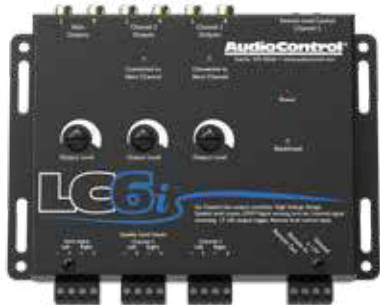
LC6i 6 Channel Line Out Converter