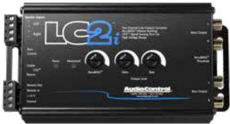
LC2i 2 Channel Line Out Converter with Accubass® and Subwoofer Control