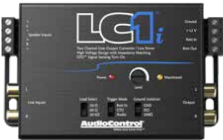
LC1i 2 Channel Line Out Converter and Line Driver