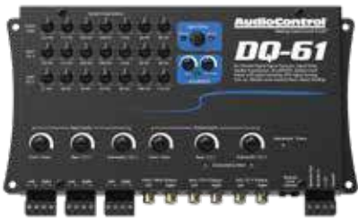
DQ-61 6 Channel Line Out Converter with Signal Delay Eq and Accubass®