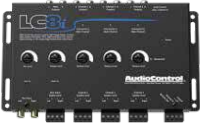
LC8i 8 Channel Line Out Converter with Auxiliary Input