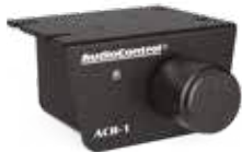
Optional ACR-1 dash remote for subwoofer level control.