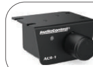
Includes the ACR-1 dash remote for subwoofer level control.