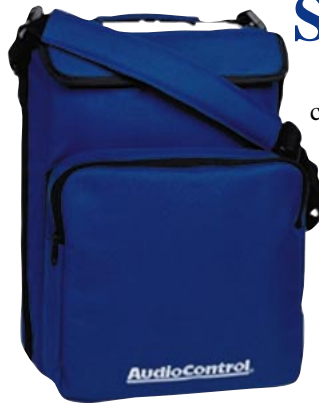
SA-3055 Carrying Case

Top performance comes from careful level setting, something not possible to do by ear. The new RCA input makes setting these levels as simple as plugging in each component and adjusting the voltage. To test a component, use the RCA input to insure everything is working correctly. Troubleshooting and performance improvement made easy.