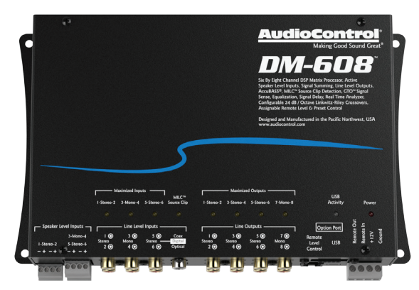
DM-608 Six by Eight Channel DSP Matrix Processor