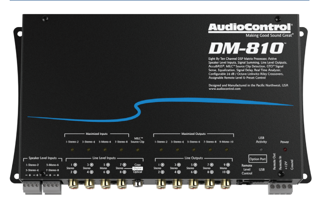
DM-810 Eight by Ten Channel DSP Matrix Processor