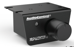
ACR-1 Remote Level Control Included